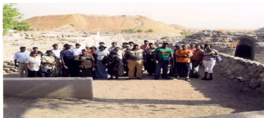
THE UNITED CHURCH OF ZAMBIA PILGRIMS DURING A VISIT TO THE HOLY LAND