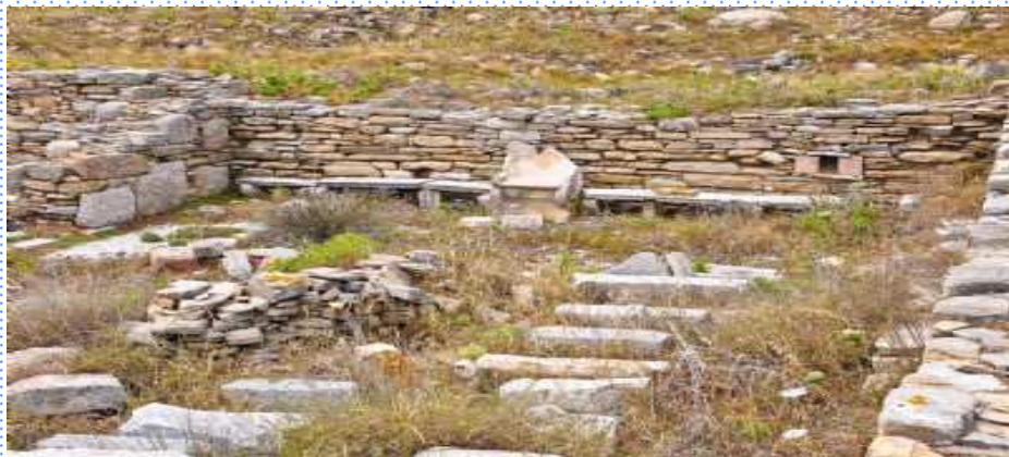
HOLY LAND - THE SYNAGOGUE

Designed and Produced by: The United Church of Zambia Synod Headquarters Communications Department