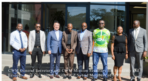
CWM General Secretary and CWM Mission Secretary for Economy and Ecology pose for a picture with UCZ Synod Members of Staff