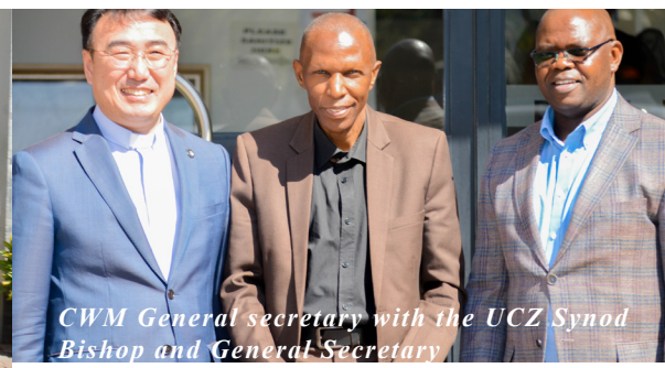
CWM General secretary with the UCZ Synod Bishop and General Secretary